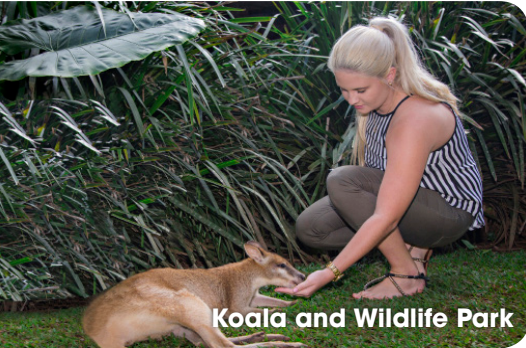
Koala and Wildlife Park

LOCALLY OWNED AND OPERATED BY THE WOODWARD FAMILY SINCE 1981