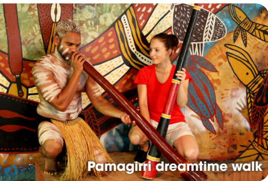
Pamagirri dreamtime walk

Army Duck Rainforest Tour with Tropical Fruit Orchard. Travel deep into the rainforest on both land and water on a guided tour.