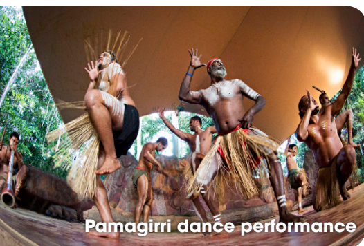
Pamagirri dance performance